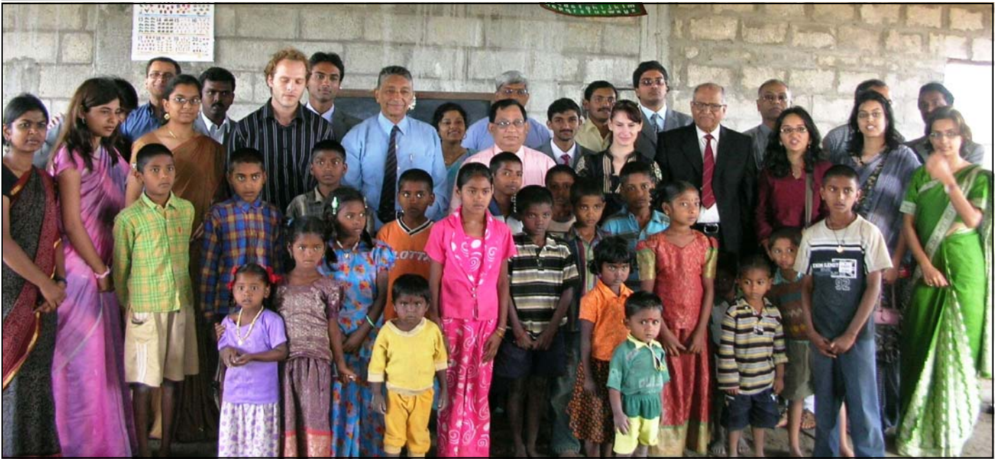
XSEED (XIME Social Empowerment, Education and Development) team with the President XIME, faculty and students at the inauguration of KidSkool at Hebbagodi.