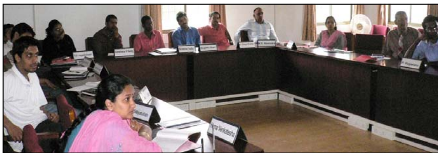
Participants of the EDP program

“Build your own career – Be your Boss” promises XIME’s Entrepreneurship Development Program which commenced on November 19, 2007. Entrepreneurship development has always been a priority area for XIME, and in association with Hewlett Packard, it promises to develop